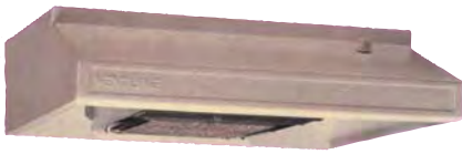
VENTLINE DUCTLESS RANGE HOOD