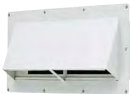
EXTERIOR VENTS FOR VENTLINE DUCTED RANGE HOODS

61100 LS 120 Volt Motor for range hoods, 100 cfm #BVD0276-00 1