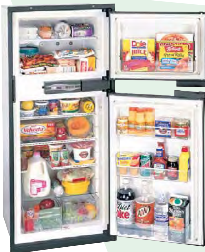
N641 (2-Way), N641.3 (3-Way)

These RV refrigerators are built to withstand the rigors of the road, as well as exposure to outdoor elements like dust, and dramatic changes in temperatures. "Two-Way" refrigerators are powered by 110 volt AC and LP gas, while "Three-Way" models also work on 12 volt DC. RV refrigeration systems use a gravity-fed evaporator to create the heat which ultimately cools, unlike a home refrigerator, which uses a compressor.