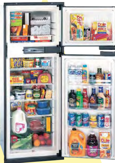
N841IM (2-Way with Ice Maker)

DOOR PANEL NOT INCLUDED; ORDER SEPARATELY