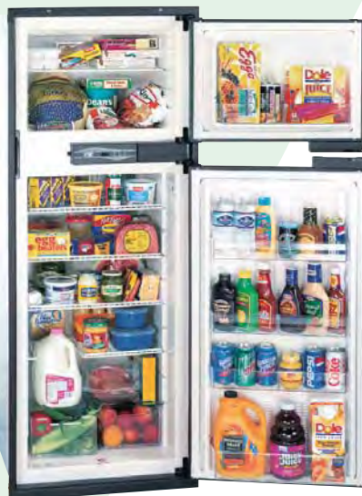
N841 (2-Way), N841.3 (3-Way)